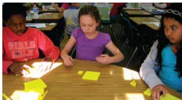
Students in Ms. Bergeron's fourth grade class can use base 10 blocks to understand and order decimals. They can also put their home-school folder on their desk and begin their morning work without being asked!